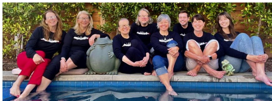
Board of Directors Latviešu Fonds

The Latvian Foundation is a non-profit organization dedicated to the preservation Latvian education, culture, and identity.